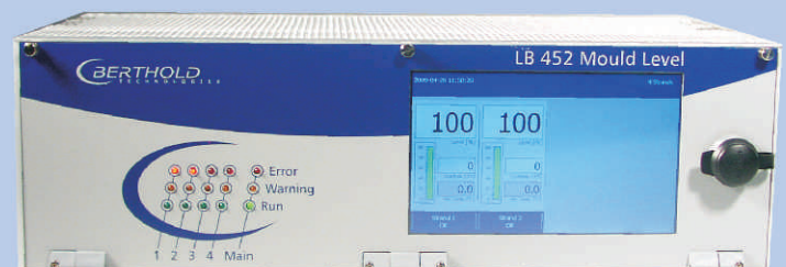
castXpert LB 452 Evaluation unit