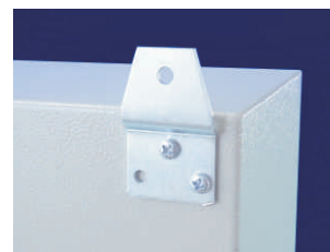
Boxes wall fixing brackets.

THE UL/CSA MARK MUST BE SPECIFICALLY REQUESTED IN THE ORDER.