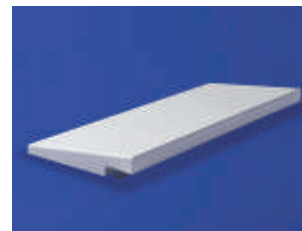
Rain protection roof.