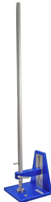
Fig. Model 304 ASTM

A fundamental point - and this applies also to the go/no-go test - is to ensure that the test is conducted at an adequate distance from the edge (at least 35 mm) and also from the previous tests on the specimen (minimum 70 mm centre to centre).