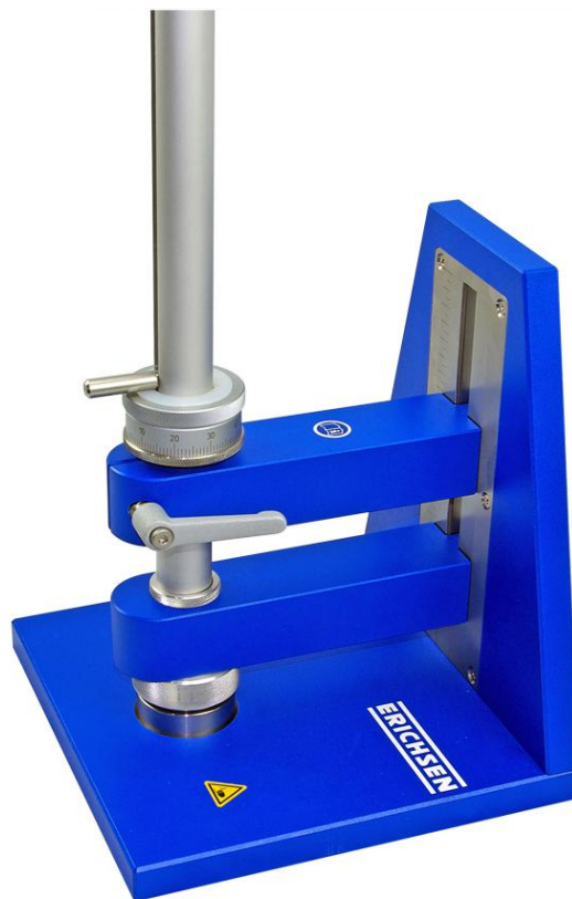
Fig. Model 304 ISO-1

Each version can be upgraded with various test sets