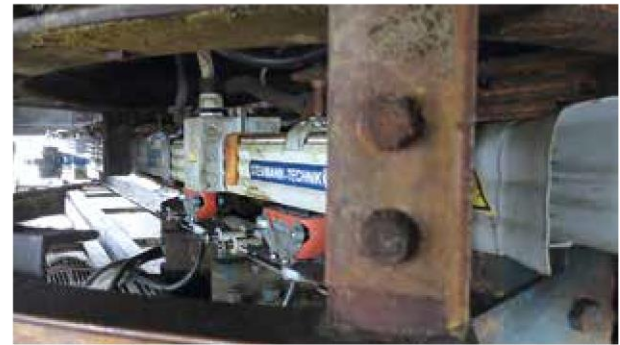
Reliability under hard operating conditions