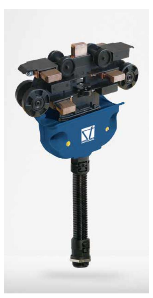
NCL current collecting trolley, 7-pole / 40a