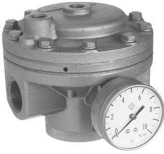
GAUGE ON OPTION