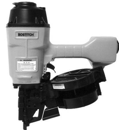
TOOL PARTS ILLUSTRATION ILUSTRACIÓN DE LAS PIEZAS DE LA HERRAMIENTA ILLUSTRATION DES PIÈCES D'OUTILLAGE

COIL-FED PNEUMATIC NAILERS CLAVADORAS NEUMÁTICAS ALIMENTADAS POR ROLLO CLOUEURS PNEUMATIQUES À ENROULEMENT