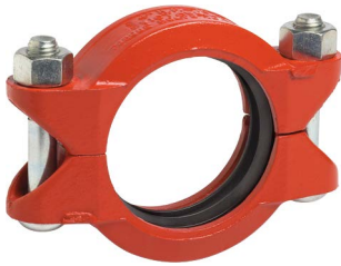
2 – 16"/50 – 400 mm sizes