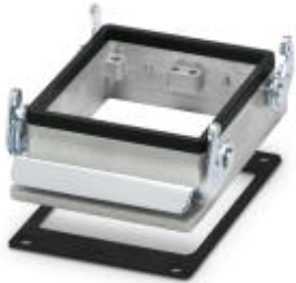
HEAVYCON panel mounting base B32, with double locking latch, height 30 mm, with flat gasket

Please be informed that the data shown in this PDF Document is generated from our Online Catalog. Please find the complete data in the user's documentation. Our General Terms of Use for Downloads are valid ( http://phoenixcontact.com/download )