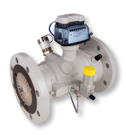
Fluxi 2000/TZ fitted with the universal totaliser and the Cyble Sensor ATEX