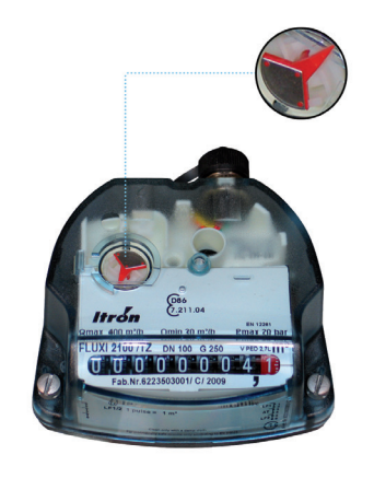
Universal totaliser fitted as standard with Cyble target